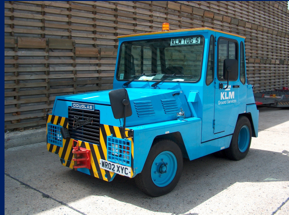
Full Cab option shown